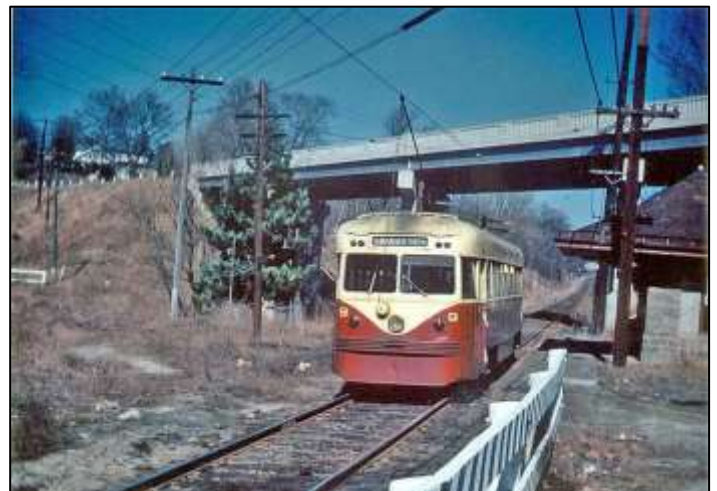
INBOUND TRIP: Here is #9 inbound at Sproul Road on the Media Line.

Since Brilliner #8 at the Shoreline Trolley Museum in Branford, Connecticut was the recipient of a recent FPT grant, we thought we would share photos from the Ernie Mozer (EAM) Collection of the three remaining Brilliners: # 5 at Pennsylvania Trolley Museum; #8 at Shore Line Trolley Museum; and #9 at Electric City Trolley Museum. As you have already noticed, the picture of #8 is on the front page.