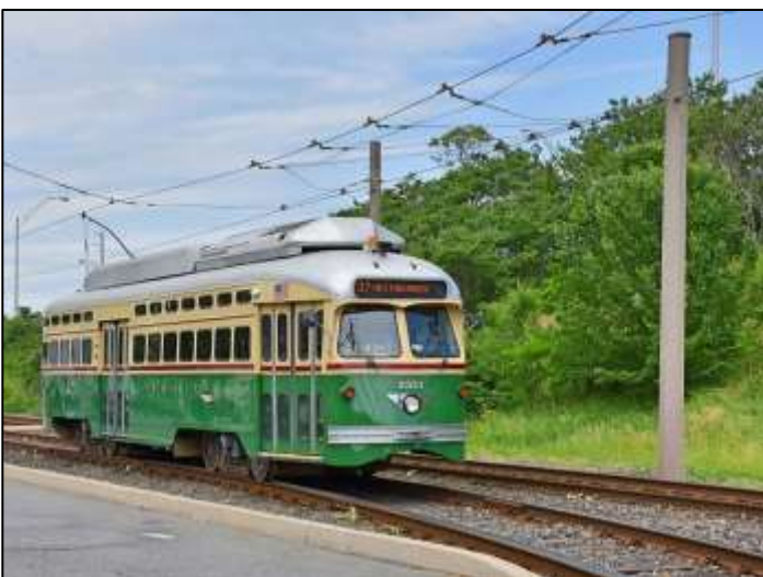
LOOPING AROUND: Car #2321 rests at the Eastwick Loop. Cars proceeded further south at one time. The Loop is very near the Eastwick Regional Rail Station.