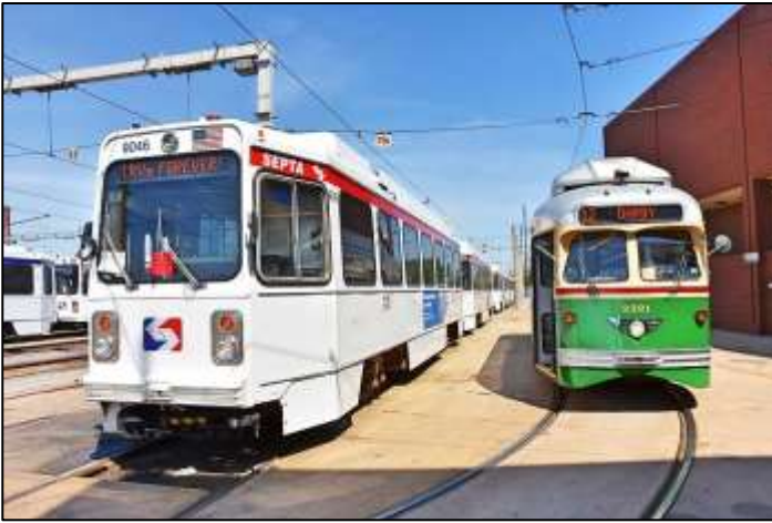
THE CHARTERED CARS: Cars #9046 and #2321 waiting at Elmwood Depot for their charter assignments.