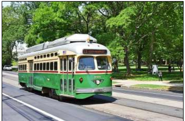
PARKSIDE: Car #2321 rolls past Clark's Park on Chester Avenue.