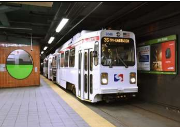
AT THE OTHER END OF THE LINE: Car #9046 pauses at the Juniper Street station on the #36 subway-surface line. There is a convenient connection to the Market-Frankford elevated line from, just steps away.