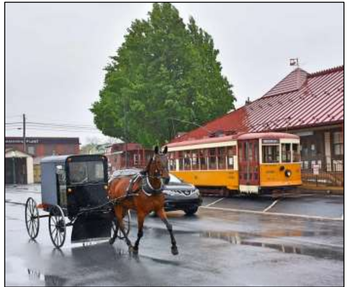
TWO KINDS OF HISTORIC TRANSPORTATION: An authentic Amish buggy passes by Birney #236 in front of Mannheim Historical Society's restored railroad station.

heritage, with a focus on cars connected with Pennsylvania and surrounding states.