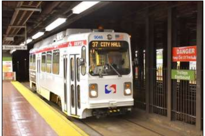
WHAT TROLLEY LINE IS IT? Car #9046 stops outbound by the 22nd Street Station on the Subway Surface Line. A sharp eye would note that the #37 line had not run through the subway since 1955.