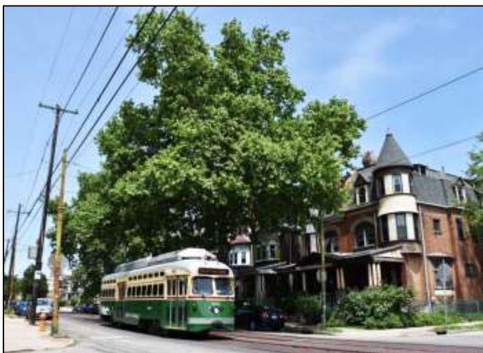
ON A QUIET STREET ON A SUNDAY: Car #2321 at 49th Street and Warrington Avenue.