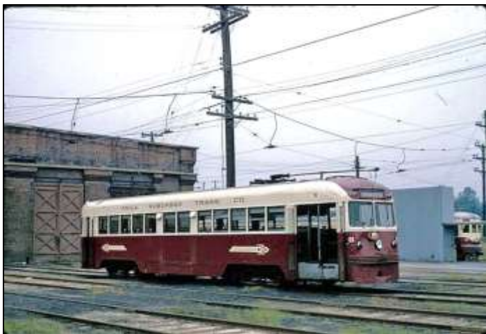
IN THE YARD: Here is #8, in maroon and cream livery at the Llanerch facility.